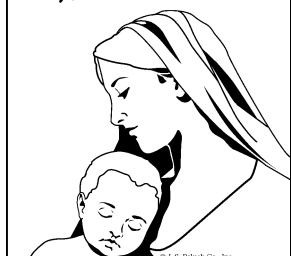
Mary, Mother of God

SUNDAY-JANUARY 3rd 10:00am Children's Liturgy of the Word(C)