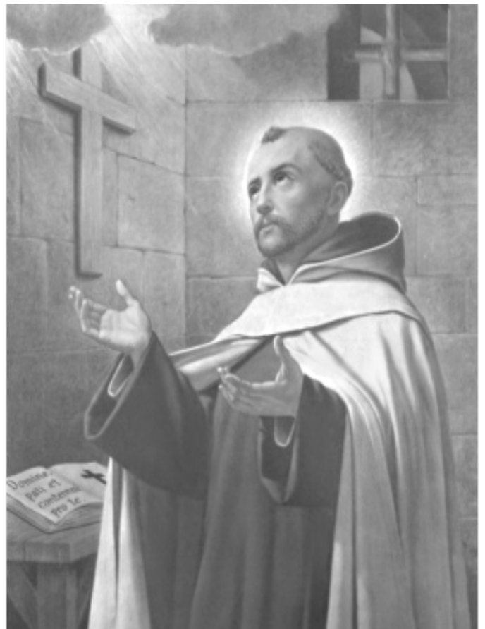
St. John of the Cross—Pray for Us