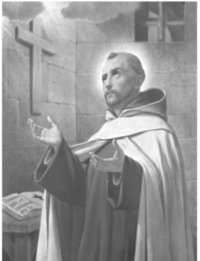
St. John of the Cross—Pray for Us